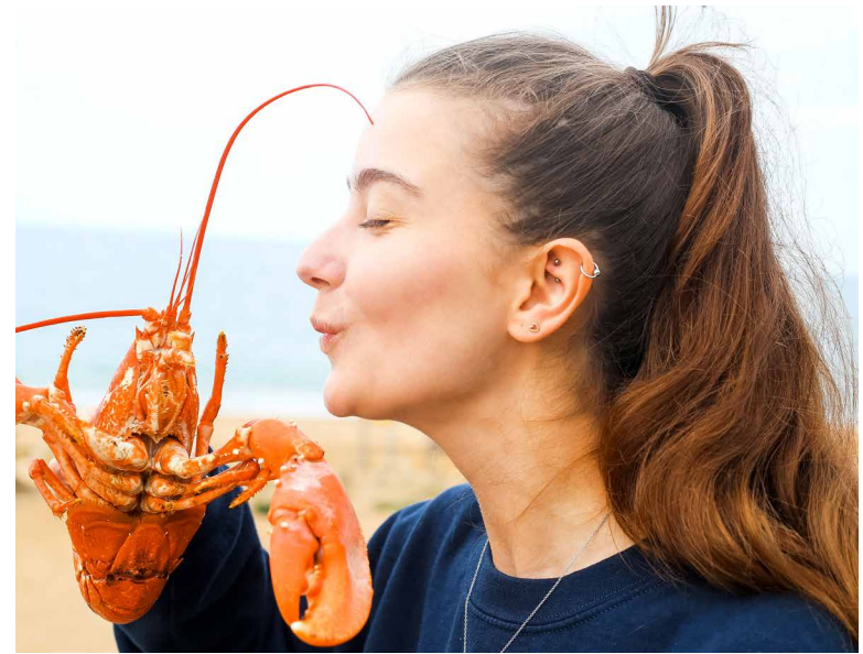
Are you following us on social media? Tag us in your photos and we might feature them!

(f) Hive Beach Cafe [6] @hivebeachcafe [7] @hive_beach_cafe [9] @hivebeachcafe