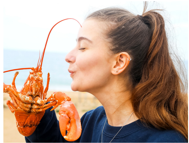
Are you following us on social media? Tag us in your photos and we might feature them!

🕜 Hive Beach Cafe 👩 @hivebeachcafe 🚺 @hive_beach_cafe 🄰 @hivebeachcafe